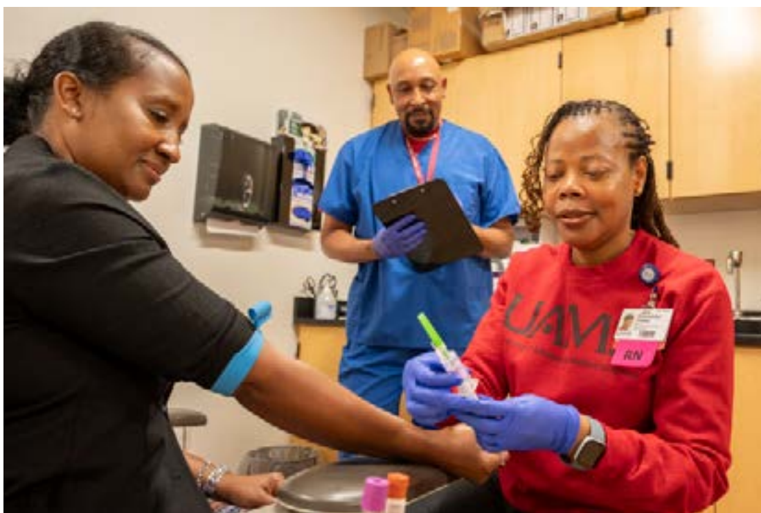
The Clinical Trials Innovation Unit (CTIU) at UAMS helps clinical trials run smoother.

At UAMS, the Clinical Trials Innovation Unit brings together coordinators, nurses, regulatory experts, and finance staff to help researchers launch and run high-quality clinical trials.